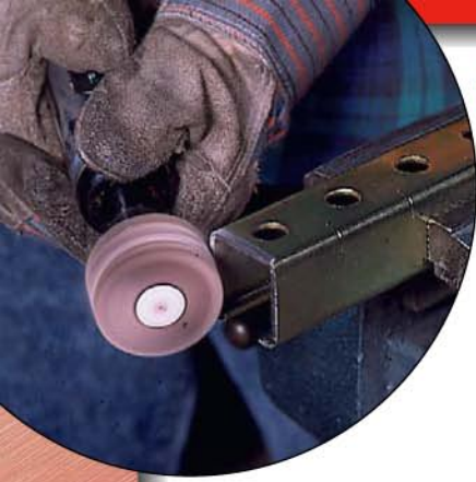
Deburring perforated steel channel after saw-cut.